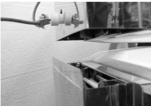
Remove the lid and put it aside. Then unlatch each of the clips around the body.